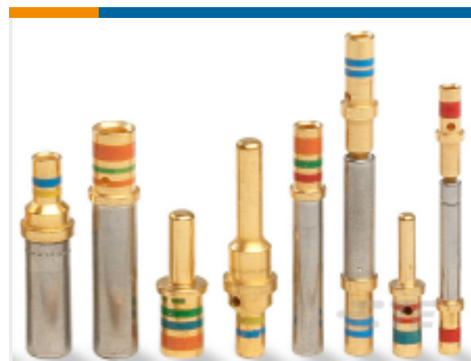
TE Part #1662-213-2031 CONT SOC ASSY