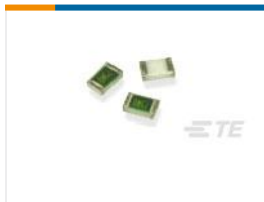
TE Part #1676394-2 RN 0805 60R4 0.1% 10PPM 1KRL