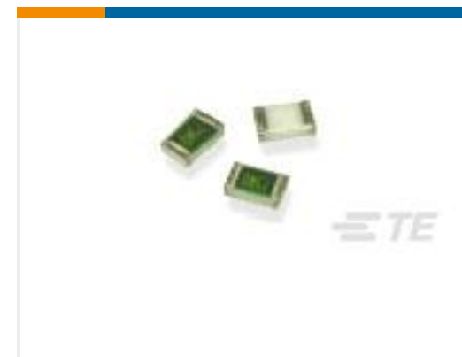
TE Part #1676237-3 RN 0805 1K5 0.1% 10PPM 5KRL