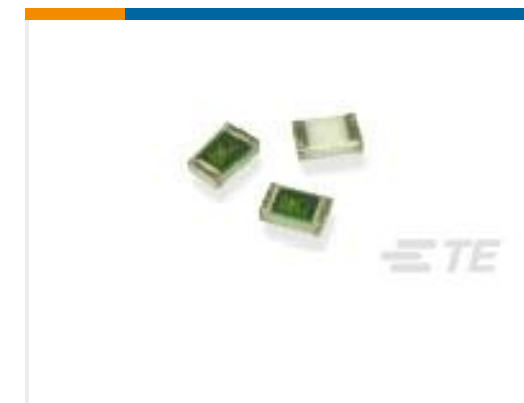
TE Part #1676290-3 RN 0805 2K49 0.1% 10PPM 5KRL