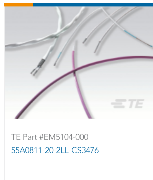
TE Part #EM5104-000 55A0811-20-2LL-CS3476