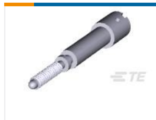
TE Part #203618-1 MALE J.S. ASSY. - SHORT