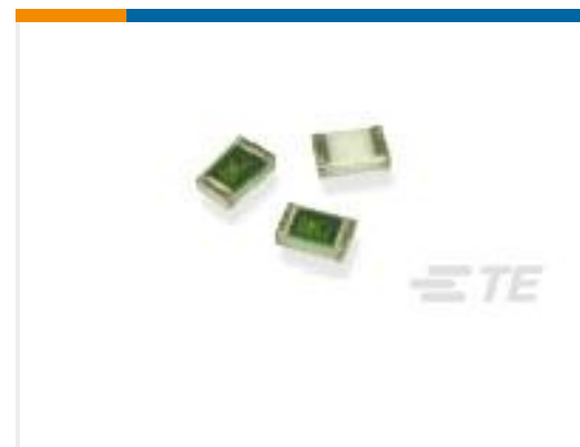
TE Part #1676142-3 RN 0805 100K 0.1% 10PPM 5KRL