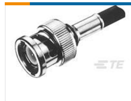
TE Part #5225395-6 BNC PLUG DUAL CP RG142