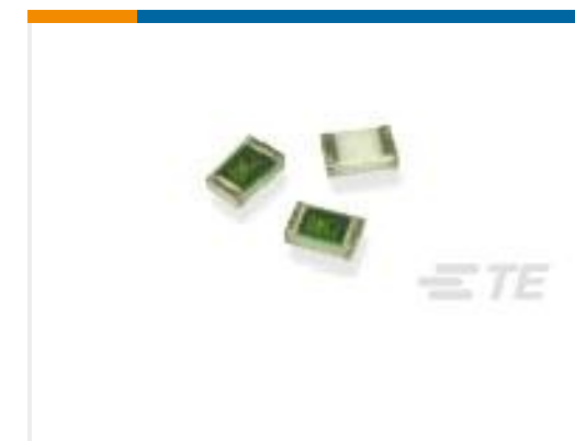
TE Part #1676352-3 RN 0805 499R 0.1% 10PPM 5KRL