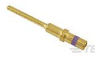
TE Part #0460-010-2031 PIN, SOLID, SIZE 20, 16-18AWG, AU