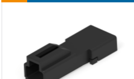
TE Part #DTMN04-2P REC, 2P, BLK, N, NON-ENVIR