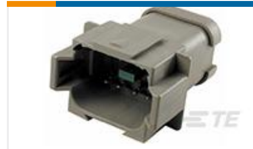
TE Part #DT04-08PA-P021 REC, 8P, GRY, BUSBAR 1X8, NICKEL, A