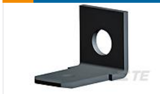
TE Part #63971-1 250 FASTON TAB TPBR