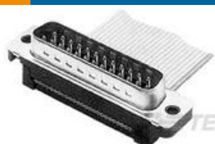
TE Part #1658608-2 25 POS HDF PLUG, MS, LEAD FREE