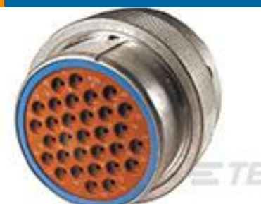
TE Part #HD36-24-31SE PLG, 31P, AL, E, 16, S