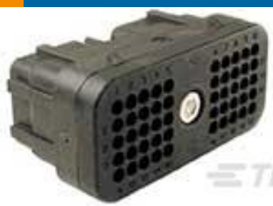
TE Part #DRC26-50S04 PLG, 50P, BLK, N, 04