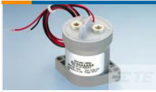
TE Part #5-1618398-0 EV100AAANA=CONTACTOR, SPST- NO 9-36Vdc