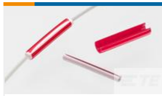
TE Part #CX2096-000 D-150-C-12