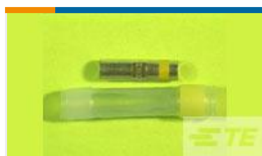
TE Part #650087-000 D-436-26