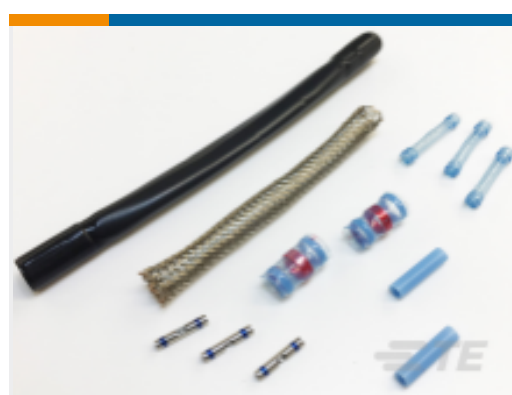
TE Part #CU1642-000 D-200-0234-RT