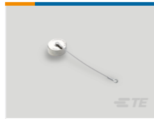
TE Part #YDTS33Z15NV0010000 CAP ASSEMBLY