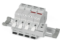
WMB marker slot for convenient identification