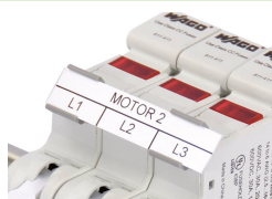
Marker carriers (285-442) for continuous marking strips