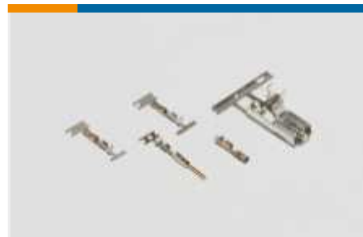
Wire-to-Board Connector Contacts(6)