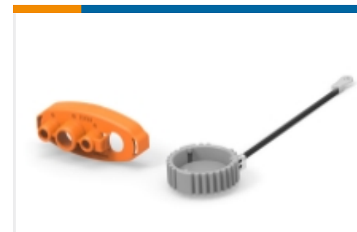
Connector Caps & Covers(19)