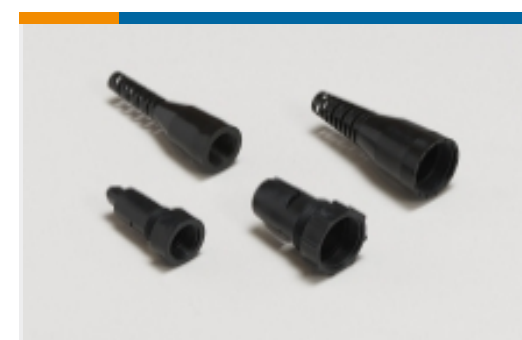
Connector Strain Relief(60)