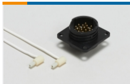
Circular Power Connectors(458)