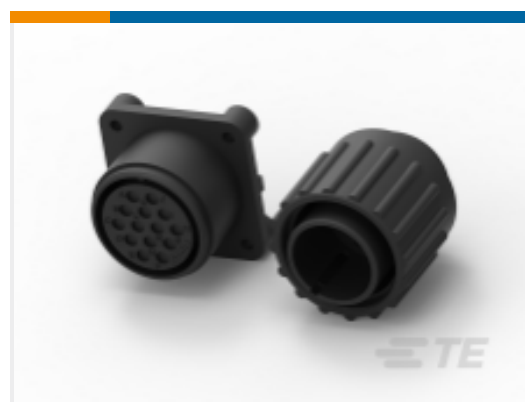
TE Part #213571-2 CPC MIL-C-5015 Connector