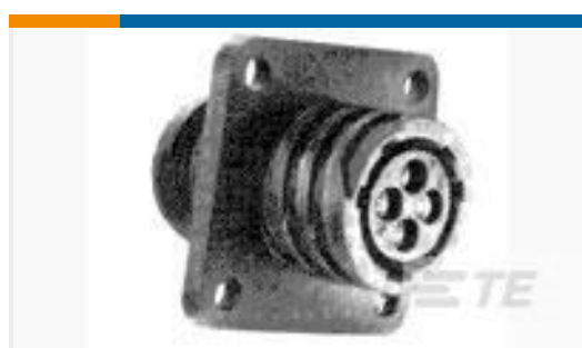
TE Part #211908-1 RECPT, 11-4, REVERSE SEX CPC