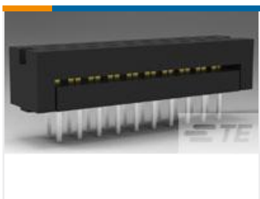
TE Part #1-746610-5 20 DIP PLUG, 100CL, LEAD FREE