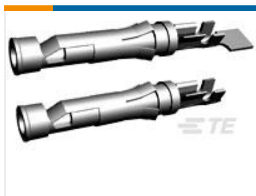
TE Part #1-66358-6 III+ SKT, 18-14, TIN, STRIP