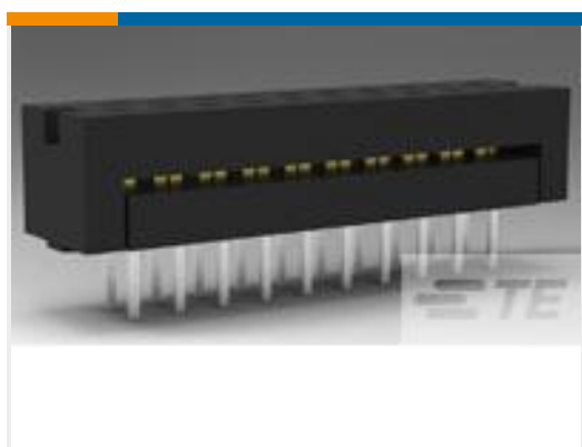
TE Part #2-746610-1 010 DIP PLUG 100CL TIN