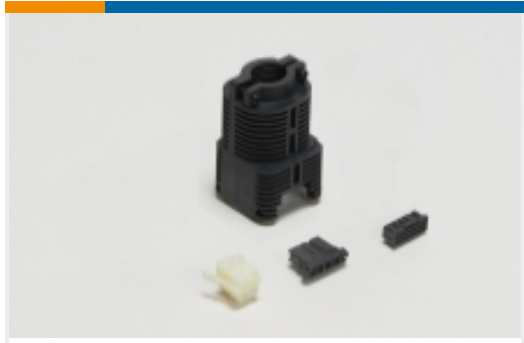
Rectangular Connector Housings(1)