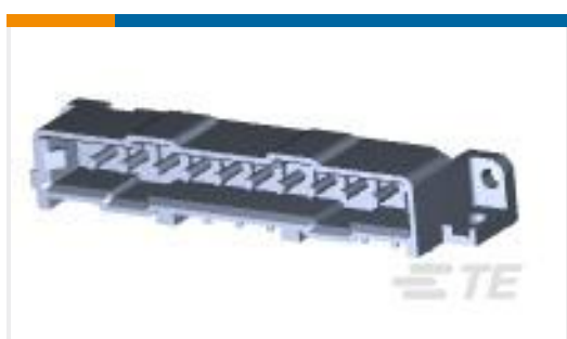
TE Part #207398-6 METRIMATE PIN HEADER ASSY, 10P