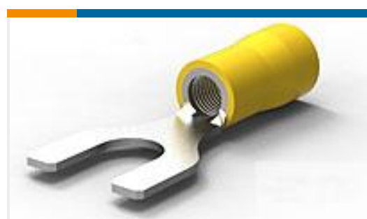
TE Part #165019 PG SPADE