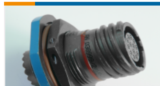
TE Part #YDTS24Z15-35SNV001 RECP ASSY