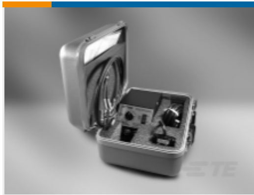
TE Part # 173643-000 RH-3960-1-TINEL-KIT-120V