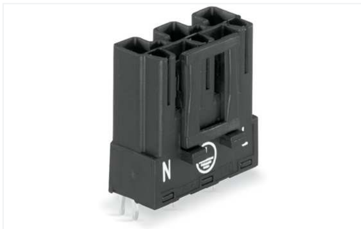
Color: ■ black