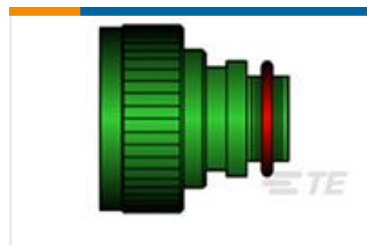
TE Part #757063-000 TXR40AB00-0807AI