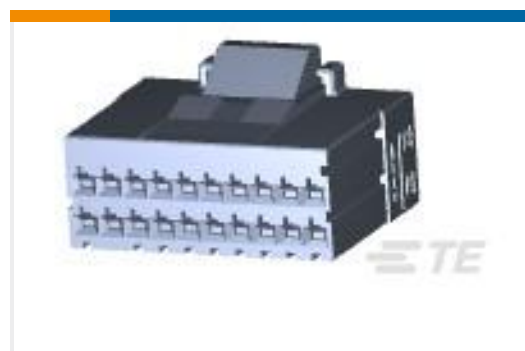
TE Part #2-1318118-9 DYNAMIC D2100 REC HSG 20P Y