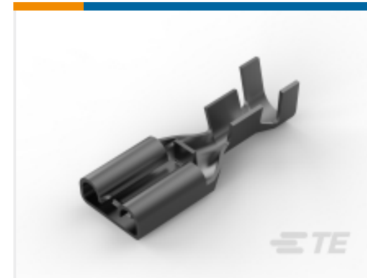
TE Part # 63854-2 250 PL MKIII REC. 18-14AWG TPBR