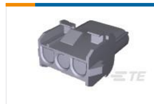
TE Part #1-350767-9 03P UMNL V0 CAP HSG BLACK