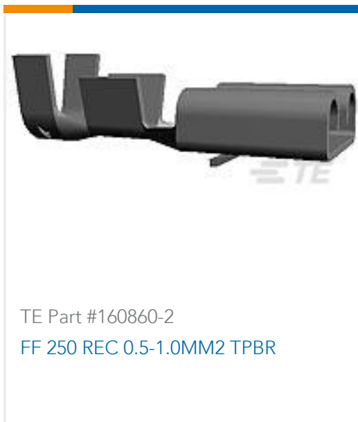
TE Part #160860-2 FF 250 REC 0.5-1.0MM2 TPBR