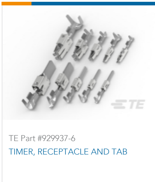
TE Part #929937-6 TIMER, RECEPTACLE AND TAB