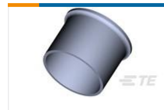
TE Part #1587723-2 INNER FERRULE, SIZE B, HVA280-