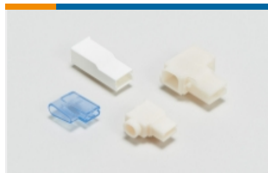
Crimp Terminal Housings(30)