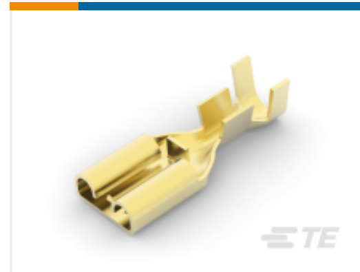
TE Part # 63854-1 250 PL MKIII REC. 18-14AWG BR