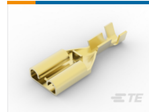
TE Part # 63933-1 PL .250 TERMINAL REC 22-18 AWG BR