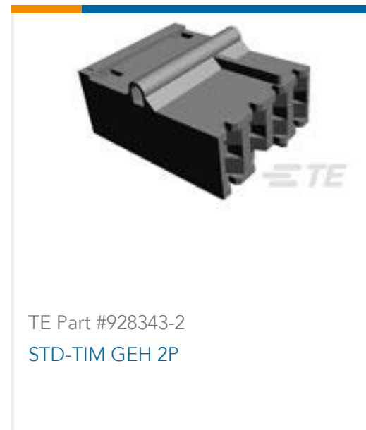
TE Part #928343-2 STD-TIM GEH 2P