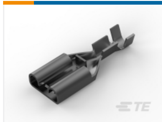
TE Part # 63933-2 250 PL MKIII REC. 22-18AWG TPBR