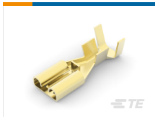
TE Part # 1217092-1 PL 250 TERMINAL RECEPTACLE 16-12 AWG BR