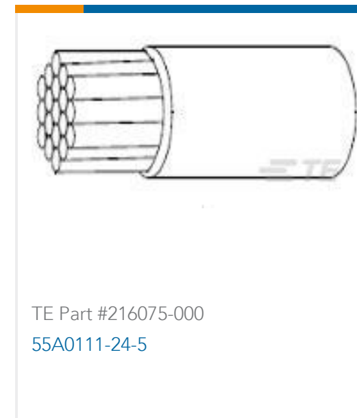
TE Part #216075-000 55A0111-24-5