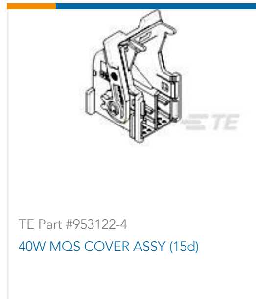
TE Part #953122-4 40W MQS COVER ASSY (15d)