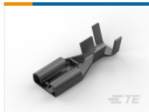
TE Part # 1217092-2 PL 250 TERMINAL REC 16-12 AWG TPBR