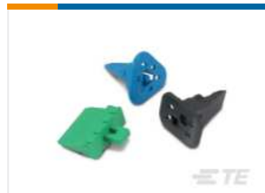
TE Part #W2S DEUTSCH DT Wedgelocks