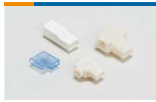
Crimp Terminal Housings(139)