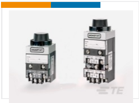
7012L8AN=RLY, NAV, ON, 2P, 115VAC, 1423158-8