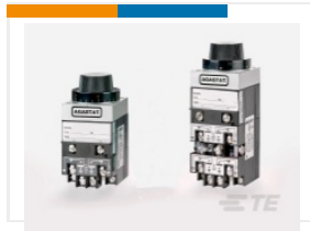
7012L8ALLN=RLY, NAV, ON, 2P, 115VA 1423158-7