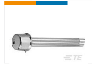
J1MACT-26XPS = M28776/5-036P J1MACT-26XPS