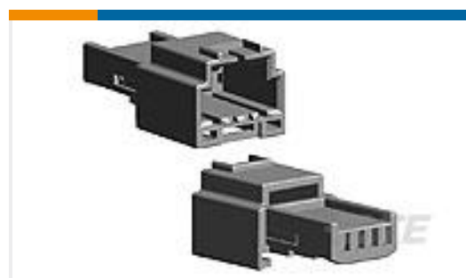
TE Part #936121-1 4POS MQS TAB