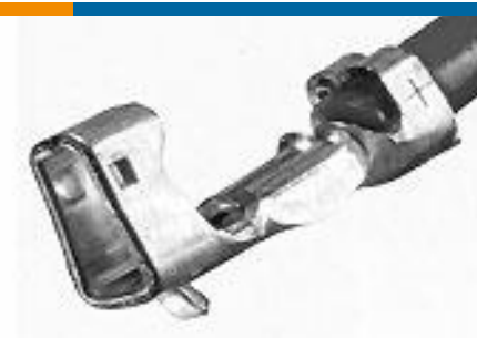
TE Part #353907-1 CT 1.5MM REC CONT CRIMP TYPE