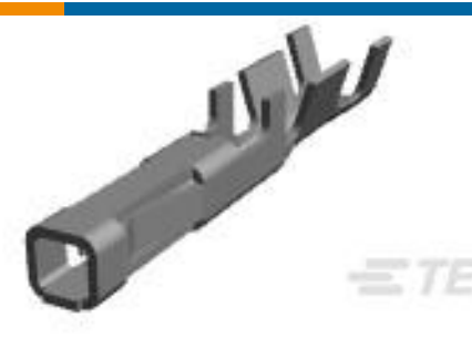
TE Part #1-794610-2 MICRO MNL RPT CNT,LS PC 30AU L