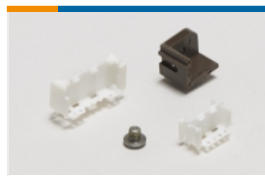
PCB Connector Mounting(1)