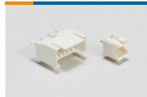
Wire-to-Board Headers & Receptacles (79)