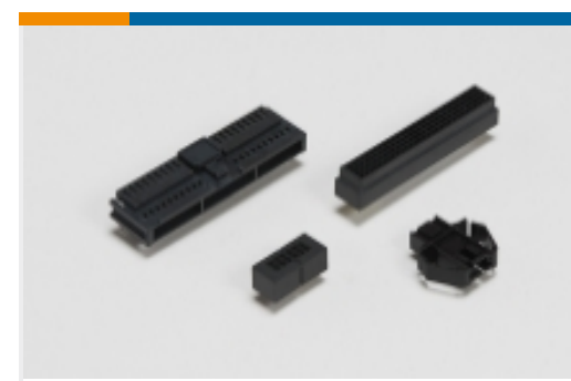
PCB Connector Shrouds(1)