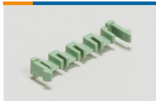
PCB Latches, Locks &amp; Retainers(2)