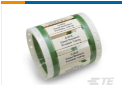
TE Part #5572350001 D-SCE Fluid Resistant Sleeves