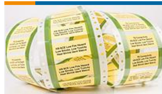
TE Part #D14525-000 HX-SCE-2.5K-4.8-50-4