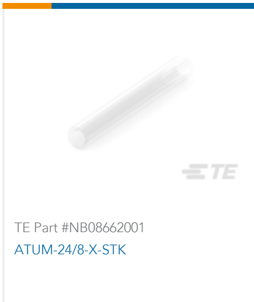
TE Part #NB08662001 ATUM-24/8-X-STK