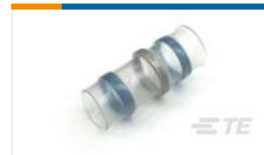
TE Part #114163-000 CWT-9003