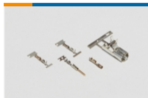
Wire-to-Board Connector Contacts(66)