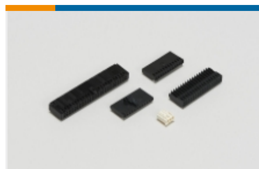
Wire-to-Board Connector Assemblies &amp; Housings(3)