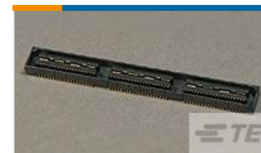
TE Part #2-1658012-3 MSB0.80RC-ASY120FL,-,10,-TY