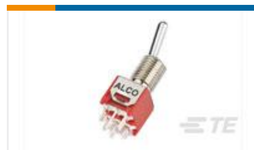
TE Part #2267077-1 TMS1T4B5M2RE