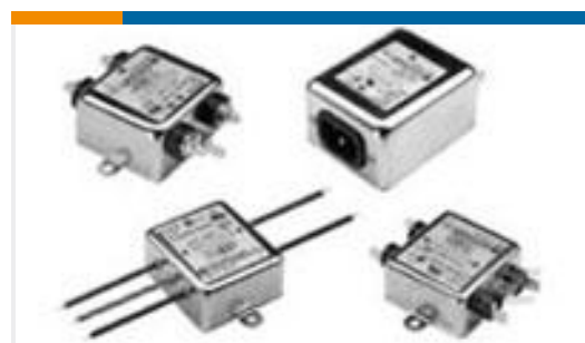
TE Part #1-6609027-5 10EK7=F7095 S0