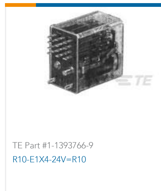
TE Part #1-1393766-9 R10-E1X4-24V=R10