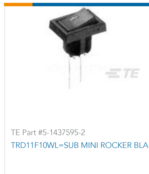
TE Part #5-1437595-2 TRD11F10WL=SUB MINI ROCKER BLA