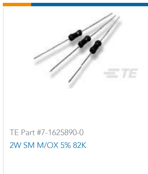
TE Part #7-1625890-0 2W SM M/OX 5% 82K