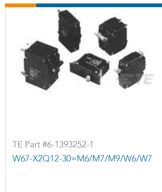
TE Part #6-1393252-1 W67-X2Q12-30=M6/M7/M9/W6/W7