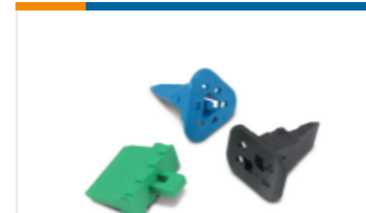
TE Part #W2S WedgeLocks: DEUTSCH DT