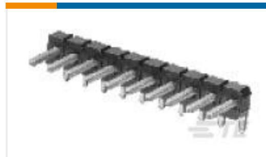
TE Part #1-825437-0 MOD 2 PINHDR 1X10P.