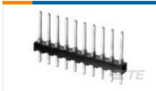
TE Part #825440-8 OD 2 PINHDR 2X08P.