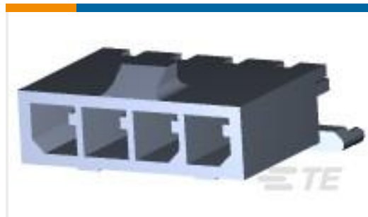
TE Part #2-1445050-4 MICRO MNL HDR ASSY S/ROW LF