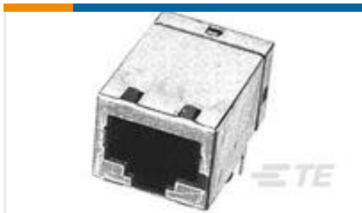
TE Part #5557789-1 MJ, 8POS, R/A, SHORTNG, PCBG