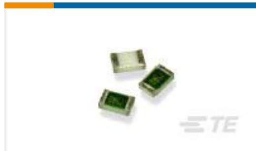
TE Part #5-1879208-1 CPF 0402 1K2 0.1% 25PPM 1K RL