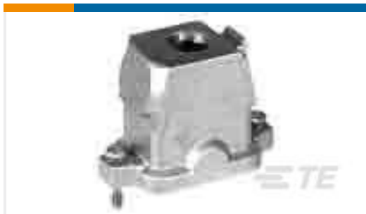
TE Part #1106416-3 EMVK6/16STO.1.M32.G