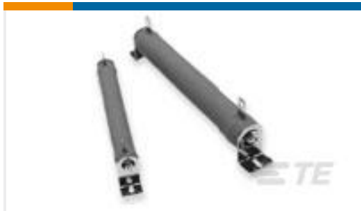
TE Part #1-1879455-3 TE 1500W 10R 5% Bracket