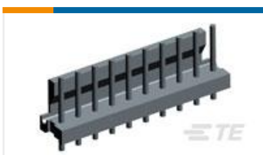
TE Part #1-640388-0 10P MTA156 HDR ASSY RN STR F/L