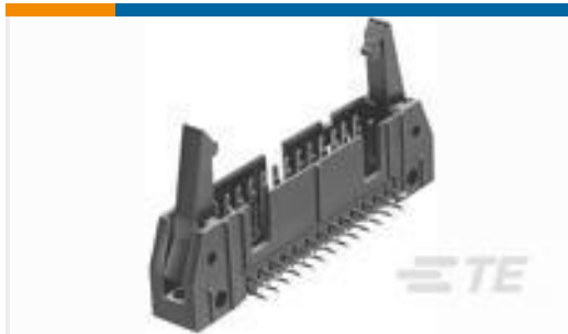
TE Part #1-5499913-0 A/L UNIV HDR 50P RA SHT LAT