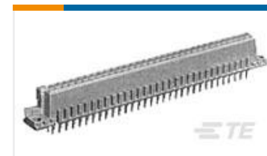
TE Part #5650860-5 ASSEMBLY,RECEPTACLE,EUROCARD, T