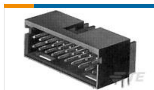
TE Part #102617-1 06 MODII HDR DRRA SHRD .100CL