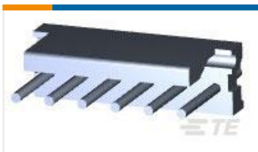
TE Part #640388-6 06P MTA156 HDR ASSY RN STR F/L