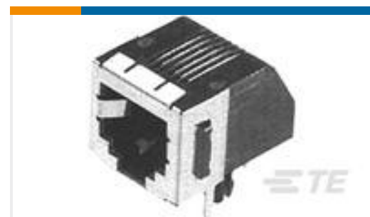
TE Part #5555140-1 MJ,LPF,R/A,6P/6C,SHLD,PNL GRD