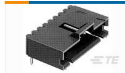
TE Part #5-104935-1 04 MTE HDR SRRA LATCH