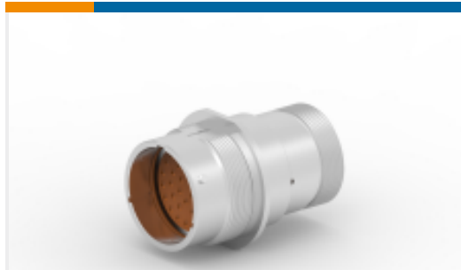
TE Part #HD34-24-33PN-072 REC, 33P, AL, N, THD ADPT DRAIN, 20, P