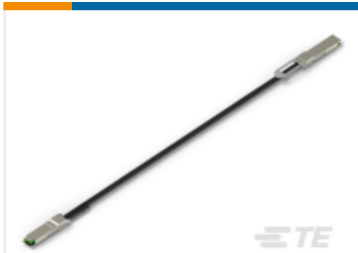
TE Part #2333393-7 QSFP 25GIG 30AWG 3 METER