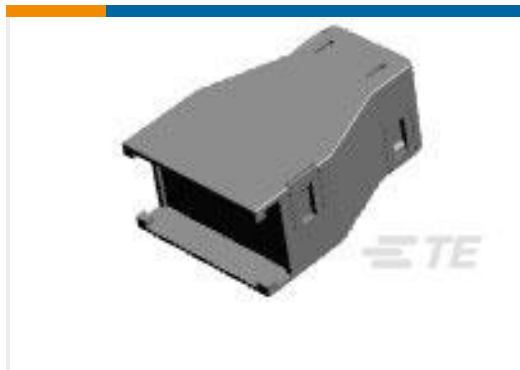
TE Part #1986185-1 Strain Relief,6 Posn,D5200 Dynamic. 2