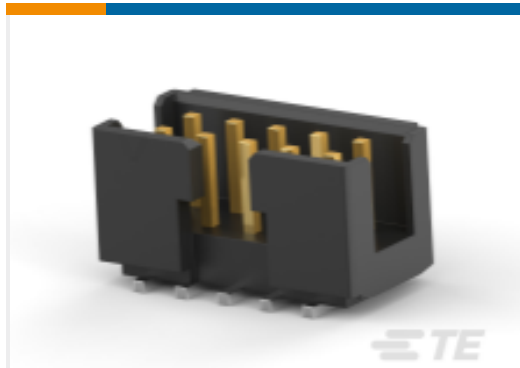
TE Part #1-2373376-0 10P,2MM,SHRD HDR,DRVT,SMD,0.1 AU,TB