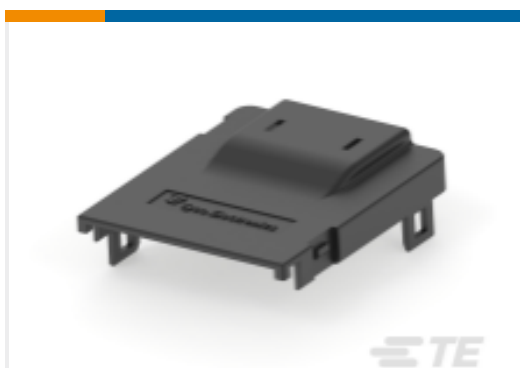
TE Part #1986186-1 Strain Relief,20 Posn,D3000 Dynamic, 2