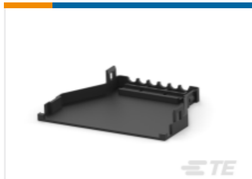
TE Part #1776695-1 Strain Relief, D5200, Dynamic