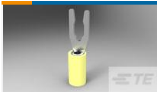
TE Part #52430-3 TERMINAL,PIDG SPR SPD 12-10 6