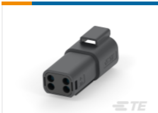
TE Part #1-2600030-0 4CCT BLACK RECEP W/LARGE SEAL