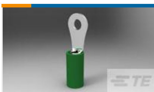
TE Part #50831 TERMINAL,PIDG PTFE R 22-20 4