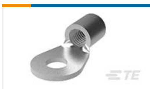
TE Part #1958292-1 KIT 12-10,1/4,NI+RT555-1/4X1