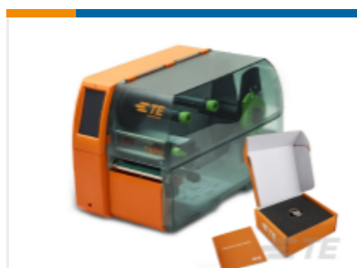
TE Part #1-2186501-1 T3212-SWARE-PRINTER