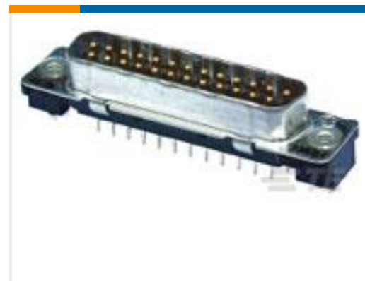
TE Part # 5-338311-2 25POS.HD20 PLUG ASS