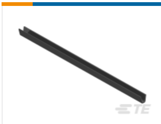
TE Part # 7574444009 RAYRIM Heat Shrink Tubing