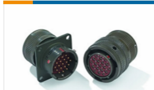
TE Part # ZPF000000000006702 951-06 RC 10-6 S 50