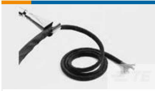
TE Part # CB03314003 RW-200-E-3/16-0-SP