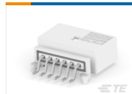
TE Part # 2317023-2 6pos MQS .63 header 90deg SMD