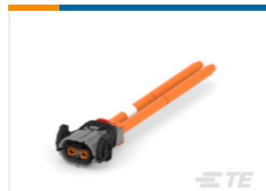
TE Part # 1-2286937-6 2POS,HVP800,180 DEG,50 SQMM, COD A,CS