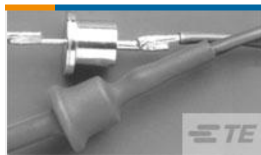
TE Part # 5677622002 RNF-3000-1.5/0.5-2-STK