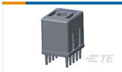
TE Part # 6643264-1 ICCON,SKT,ASSY