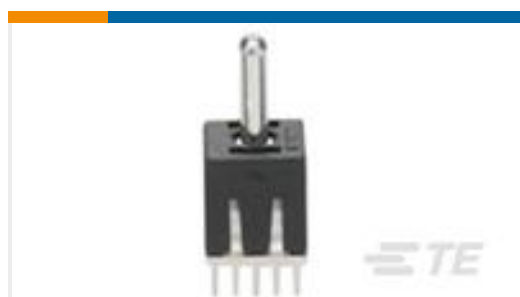
TE Part #6643283-1 ICCON,PIN,ASSY