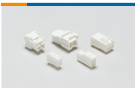
Rectangular Power Connectors(15)