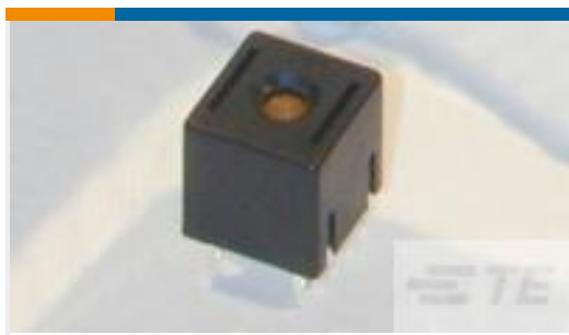
TE Part # 6643269-1 ICCON,SKT,ASSY