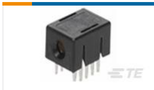
TE Part # 6643272-1 ICCON,SKT,ASSY