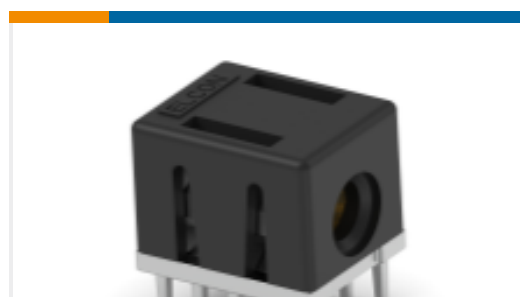
TE Part #6643232-1 ICCON,SKT,ASSY