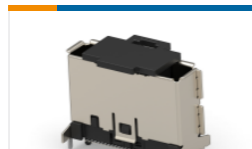
TE Part # 2292096-1 RCPT ASSY SMT VERT 50 POSN MBC