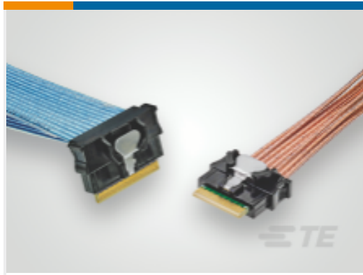
TE Part # 2821750-1 SLIVER C/A, 50P, STR TO STR 25GHZ 100OHM