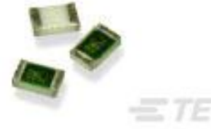
TE Part # 2-1879216-3 CPF 0402 86K6 0.1% 25PPM 1K RL