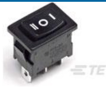
TE Part # 1571079-4 PRASD1-16F-BB000=POWER ROCKER