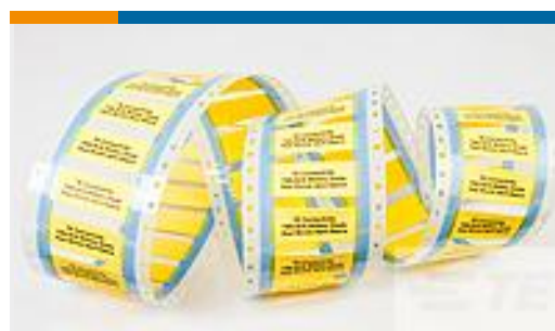
TE Part # 5273550001 TMS-SCE-3/16-2.0-9