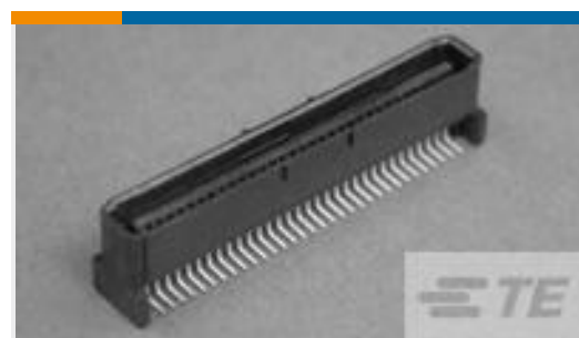
TE Part # 120527-1 1FHP,64,30A/P,S,N,S10,12,13,15