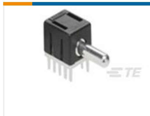
TE Part #6643431-1 ICCON,PIN,ASSY