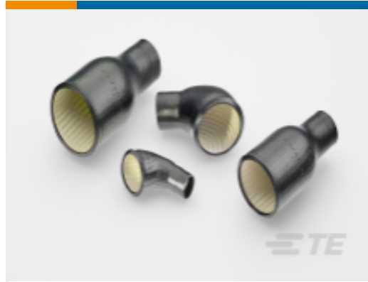
TE Part #EK7354-000 222S152-25C-G28-0