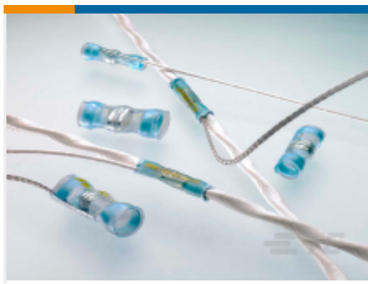
TE Part #CA7641-000 S200-3-9030