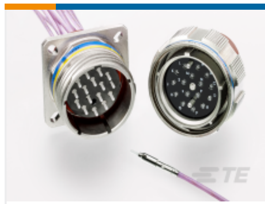
TE Part #YMC8016-W-11-02SN0 ARINC 801, TYPE 1 PLUG CONNECTOR