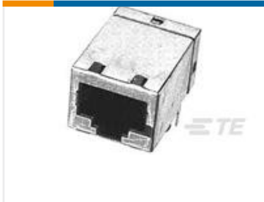
TE Part #2-1734795-2 RJ45,8P8C,SHD,G/G LED, W/ Panel, 15u"Au