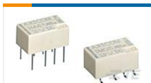
TE Part # 3-1462039-8 IM06DTS=IM RELAY 140mW 12V