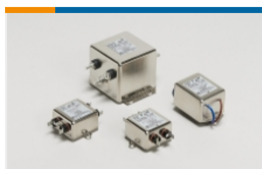
Single Phase Filters(30)