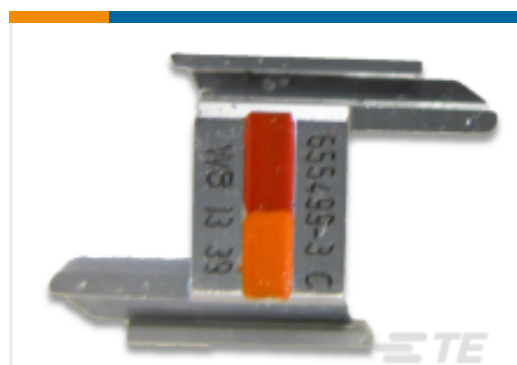
TE Part #655499-3 TWIN MANDREL