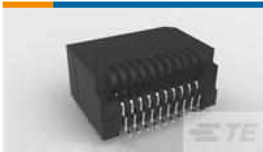
TE Part #1888247-1 20 POS SMT CONN, SFP/SFP+, 30A