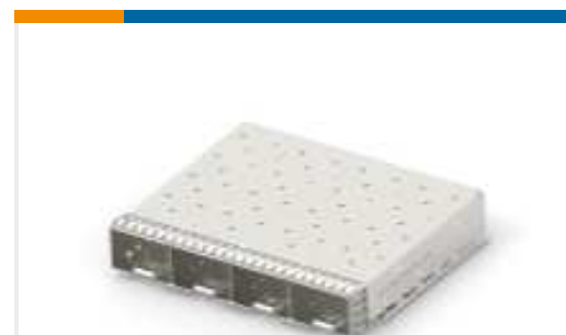
TE Part #2300275-1 zSFP+ 1x4 Cage Assembly, Press-Fit