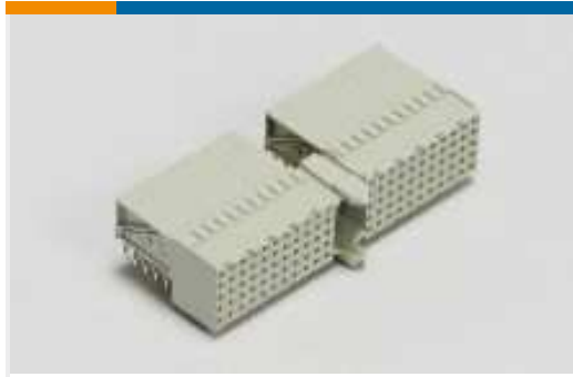
Hard Metric Backplane Connectors(1)