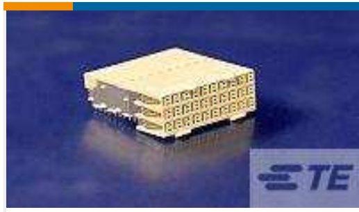
TE Part # 6469081-2 HMZD 3PR, RECEPTACLE ASSEMBLY