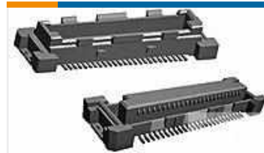
TE Part #1-5353190-0 .6FHR04H,140,S,GIG,08/Sn,TR,NSYes