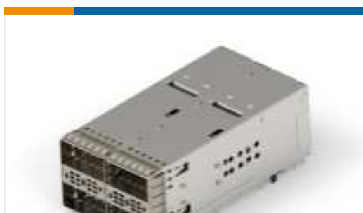
TE Part #2301859-7 ZQSFP+ STACKED RECEPTACLE ASSEMBLY 2X2