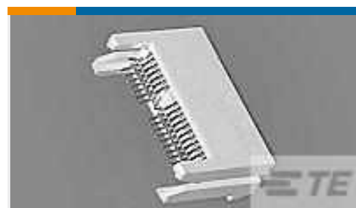
TE Part #3-1734857-4 PCI EXP STRADDLE 98P WHT 15u"