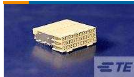
TE Part #6469081-1 HMZD 3PR, RECEPTACLE ASSEMBLY