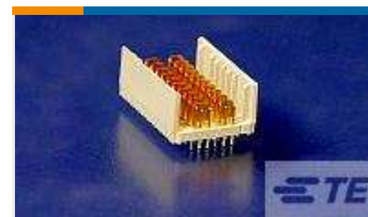
TE Part #6469025-1 HM-ZD 2PR HDR 40P 2.5MM