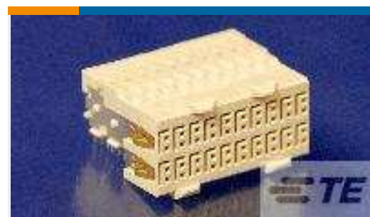
TE Part #6469028-1 HM-ZD 2PR RECP 40P