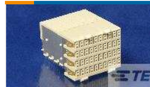
TE Part #6469001-1 HM-ZD 4PR RECP 80P