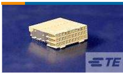
TE Part # 1645616-2 HMZD 3PR, RECEPTACLE ASSEMBLY 30Au