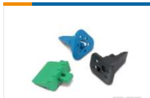
TE Part #W2S DEUTSCH DT Wedgelocks