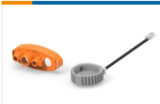
Connector Caps & Covers(69)