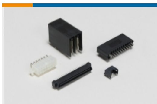
Standard Rectangular Connectors(495)