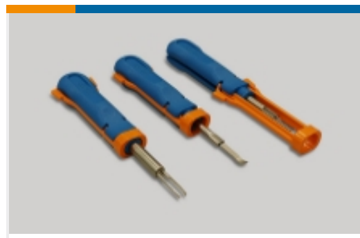
Insertion & Extraction Tools(6)