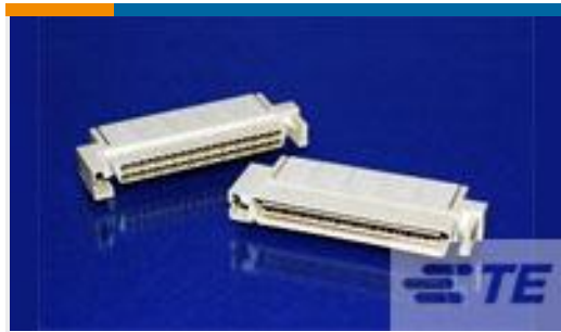
TE Part # 6367580-4 ASSY Z-DOK+4 HOST BOARD 32PR