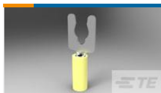
TE Part #52924 TERMINAL,PIDG SPR SPD 26-22 6