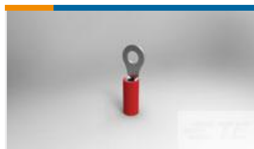
TE Part #326878 PIDG R 22-16 COMM 22-18 MIL 6