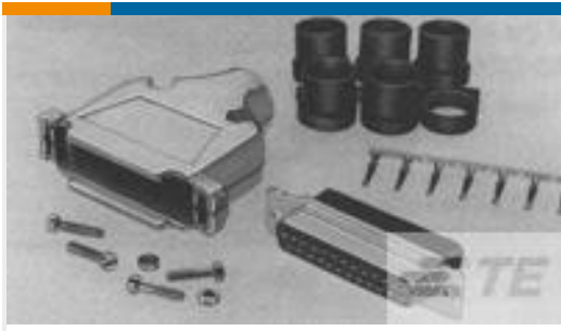
TE Part #749806-7 KIT, HDP-20, RCPT, SIZE 1, 9 POSN