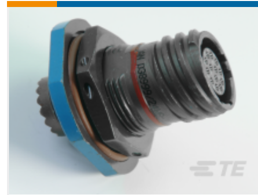
TE Part #YDTS24F17-06PNV001 RECP ASSY