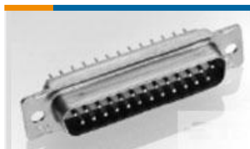
TE Part #205166-1 AMPLIMITE,ASY,PLUG,STD,109,3