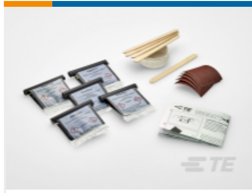
TE Part #878462-000 S1125-KIT-1