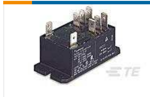
TE Part #1393212-5 T92S7A22-240