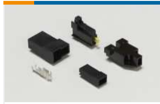
Magnet Wire Terminals(429)