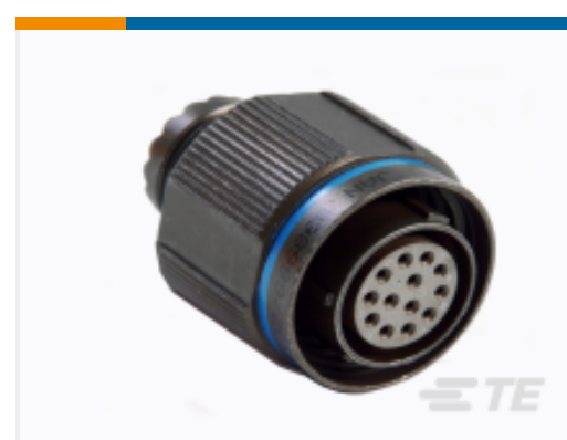
TE Part #YDTS26W15-97SNV001 PLUG ASSY