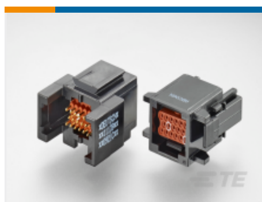
TE Part #ABC03N-22P-4048 IN-LINE RECP