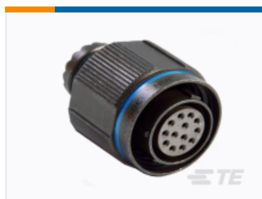
TE Part #YDTS26F19-35PAV001 PLUG ASSY