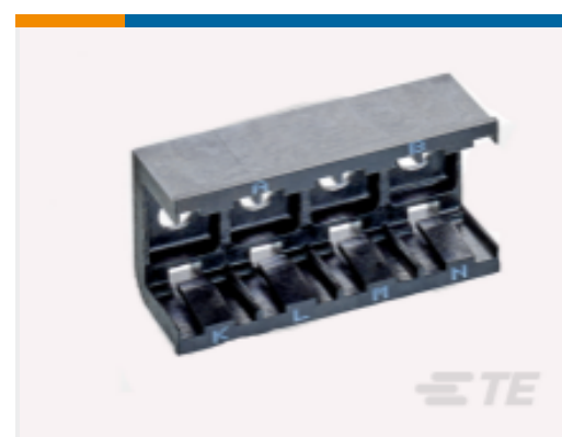
TE Part #DCR-1A-04 COMPOSIT RAIL