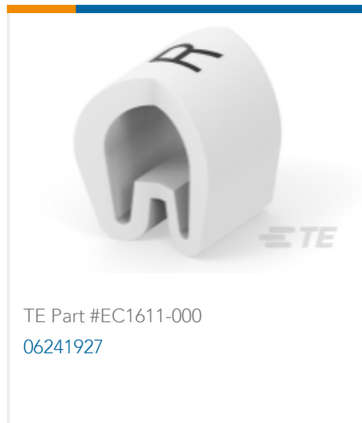
TE Part #EC1611-000 06241927