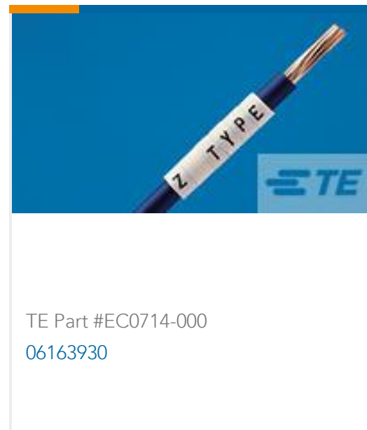
TE Part #EC0714-000 06163930