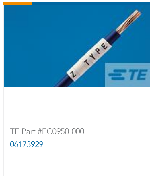
TE Part #EC0950-000 06173929