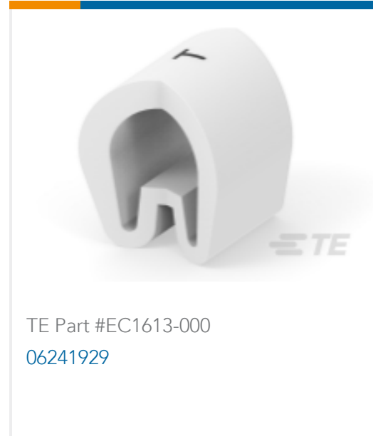
TE Part #EC1613-000 06241929