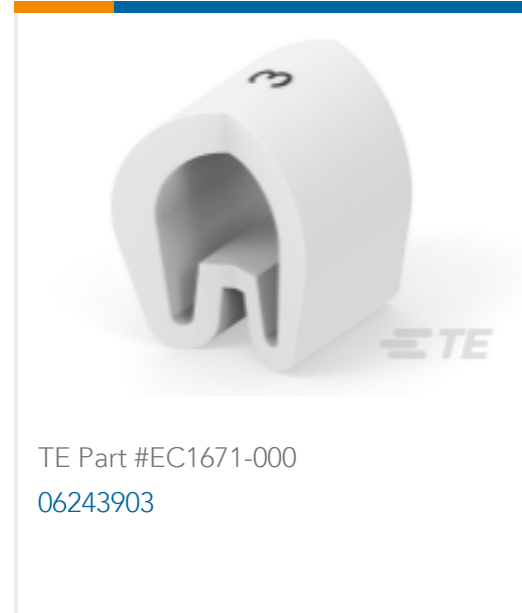
TE Part #EC1671-000 06243903