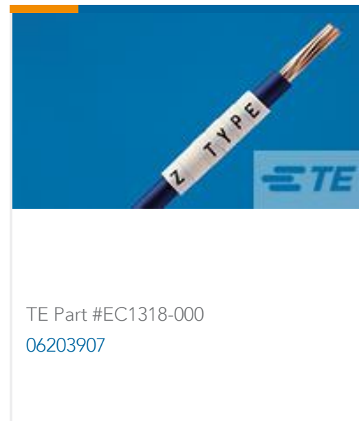
TE Part #EC1318-000 06203907