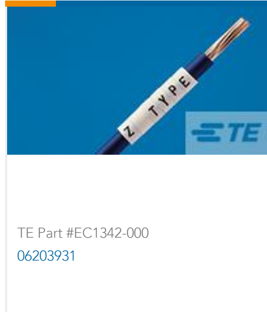
TE Part #EC1342-000 06203931