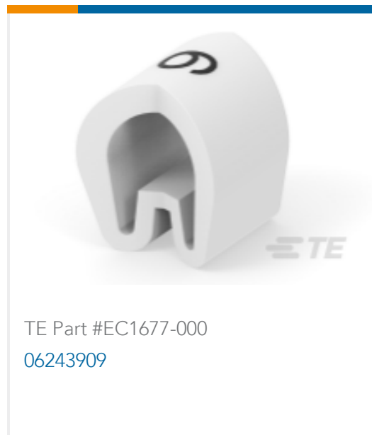
TE Part #EC1677-000 06243909