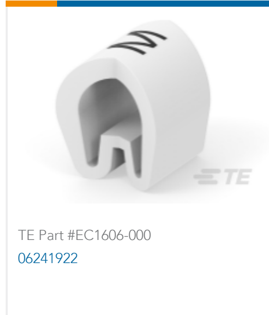
TE Part #EC1606-000 06241922