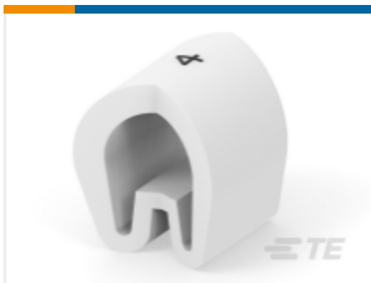
TE Part #EC1410-000 06221904