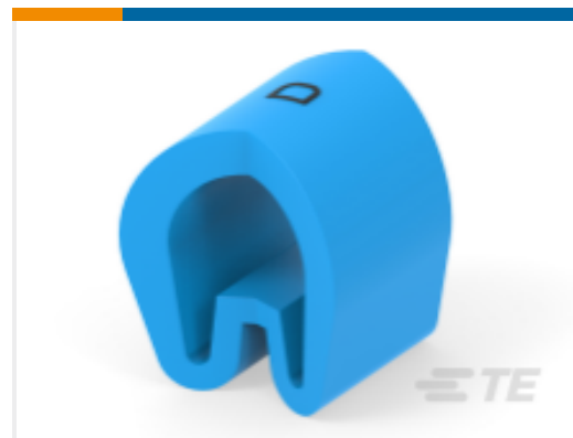
TE Part #EC0819-000 06171613