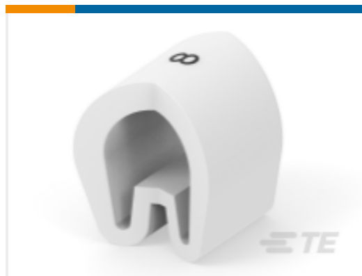
TE Part #EC1414-000 06221908