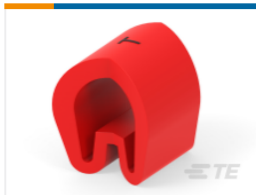
TE Part #EC0786-000 06171210