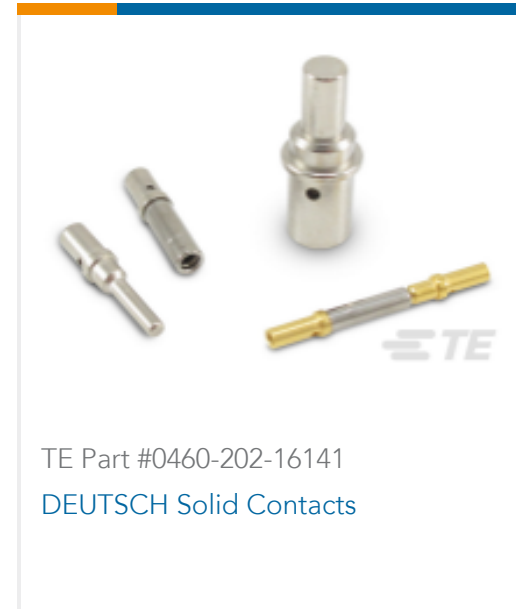
TE Part #0460-202-16141 DEUTSCH Solid Contacts DT