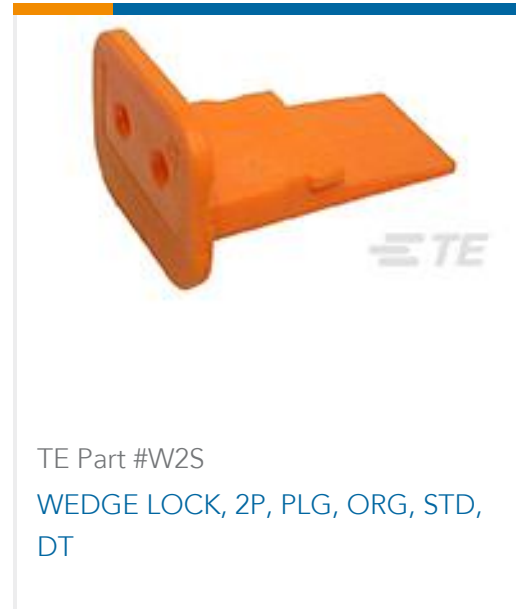
TE Part #W2S WEDGE LOCK, 2P, PLG, ORG, STD, DT