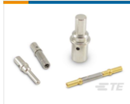
TE Part #0460-215-16141 DEUTSCH Solid Contacts