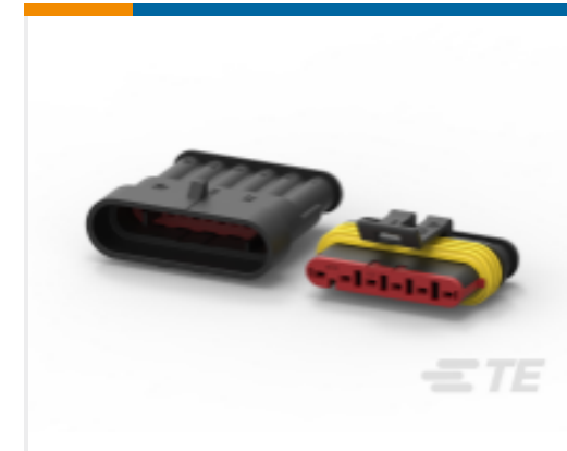
TE Part #282087-1 AMP SUPERSEAL 1.5MM, CONNECTOR HOUSING