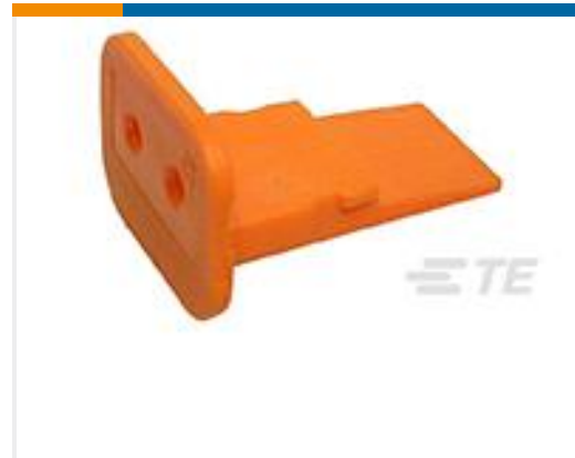
TE Part #W2S WEDGE LOCK, 2P, PLG, ORG, STD, DT