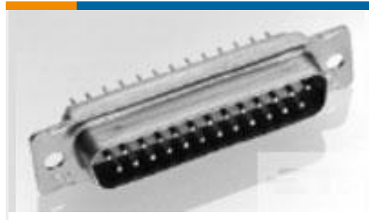
TE Part #205169-1 RECEPT ASSY,50 POSN,AMPLIMITE