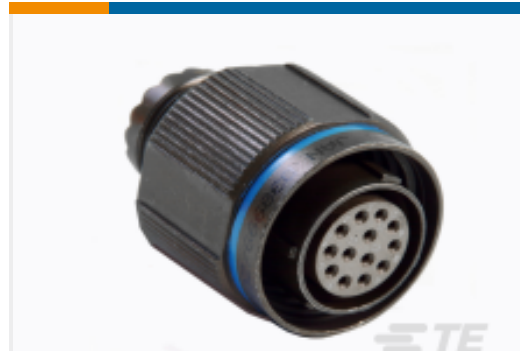
TE Part #YDTS26W19-35PNV001 D38999: Straight Plug, 19-35 Insert