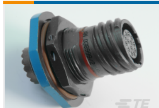
TE Part #YDTS24W19-35PAV001 RECP ASSY