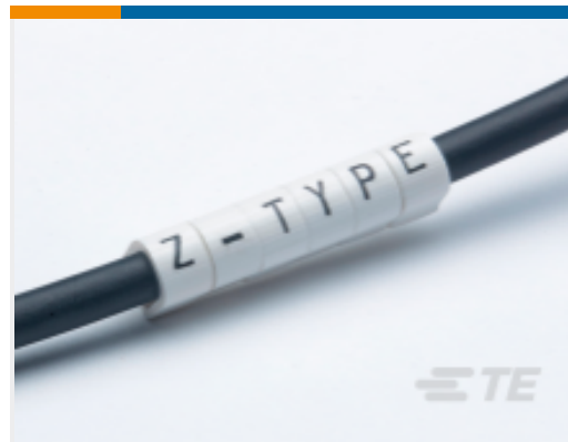
TE Part #EC1046-000 06181909