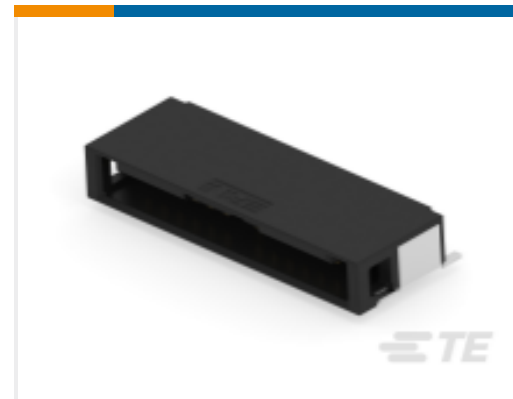
TE Part #514496-E MCBA 14 M * SMD 137 * 176 * GURT C7 J 2