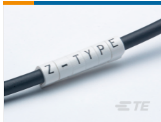
TE Part #EC0573-000 06161202