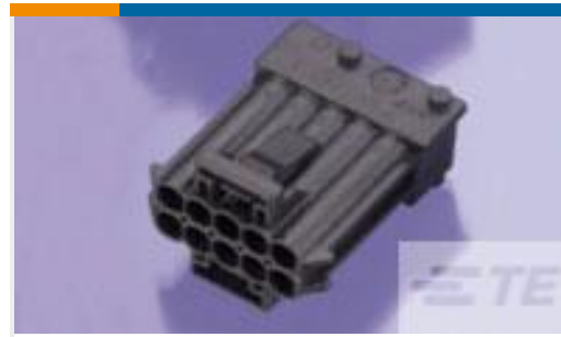
TE Part #1-965421-1 FLA-STE-GEH2,8 2P