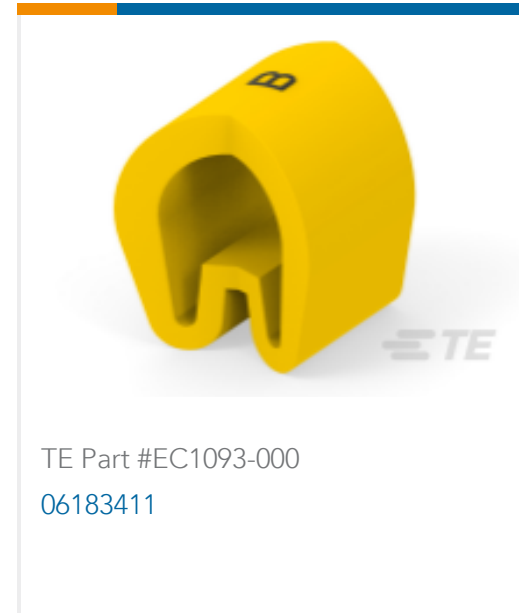
TE Part #EC1093-000 06183411