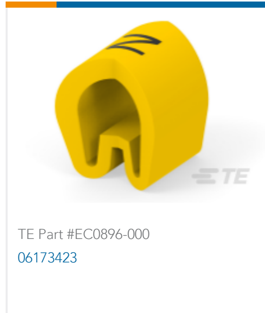
TE Part #EC0896-000 06173423