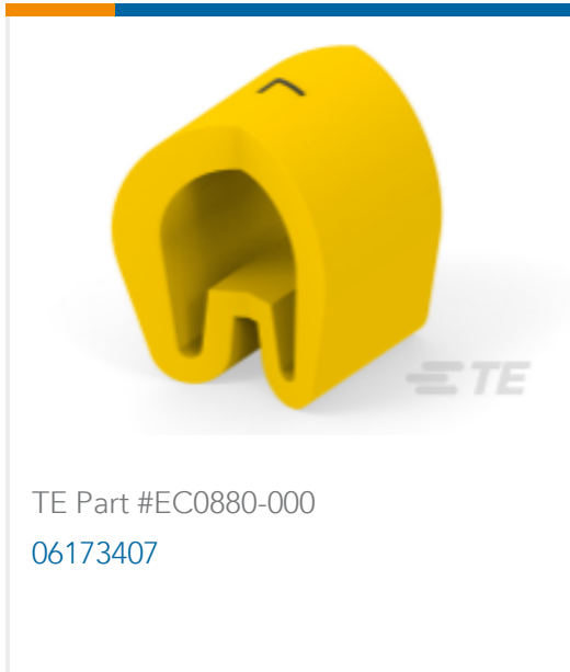
TE Part #EC0880-000 06173407