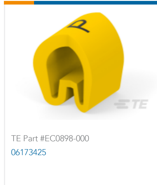
TE Part #EC0898-000 06173425