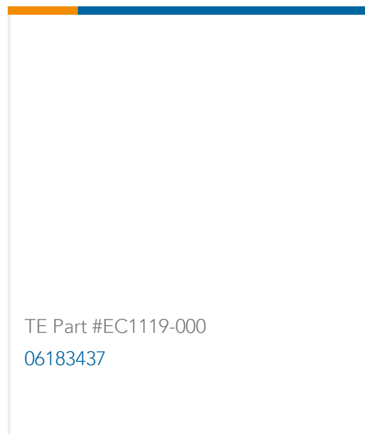
TE Part #EC1119-000 06183437