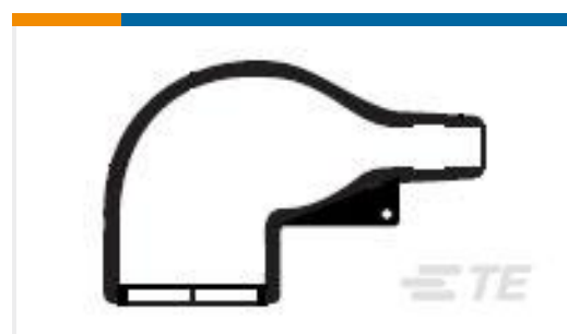
TE Part #636000-000 222K163-100/184-0