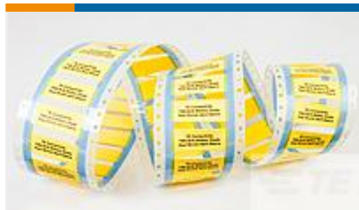
TE Part #6641710001 TMS-SCE-1/4-2.0-9