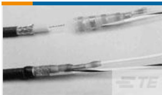
TE Part #521076-000 D-181-1220-90/9