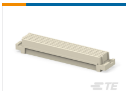
TE Part #024070-E STVBUG E 160 CSI 172 9999 * J 4 24070 FE